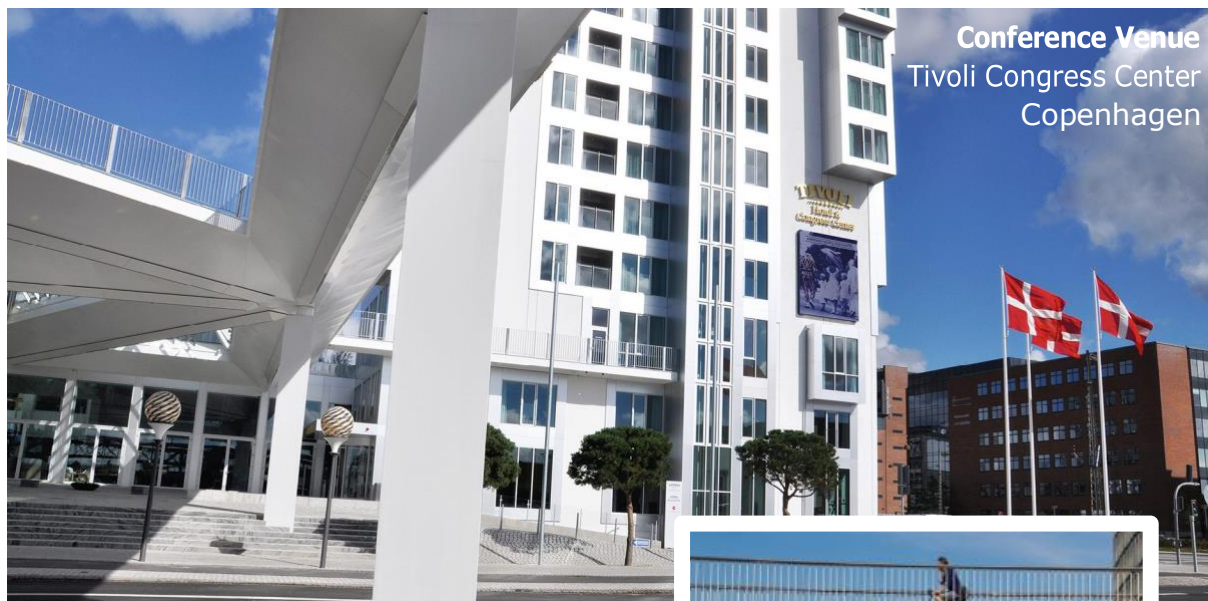
Conference Venue Tivoli Congress Center Copenhagen